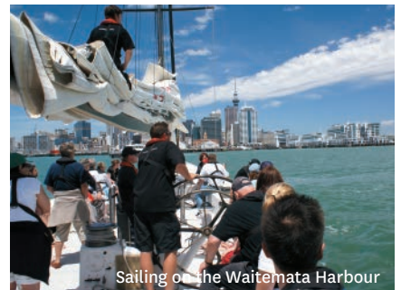
Sailing on the Waitemata Harbour