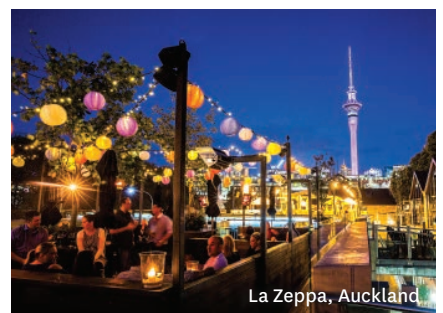
La Zeppa, Auckland