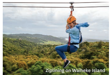
Ziplining on Waiheke Island