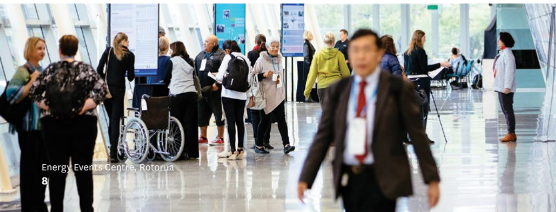
Energy Events Centre, Rotorua

"Tourism New Zealand was a wonderful and generous partner and we believe their support was pivotal to the success of our bid. They helped us fund a feasibility study so we were confident that we could manage the conference fiscally as well as in terms of the scientific programme. They also financially supported us to prepare the bid, to travel and present, and continued to provide advice and support."