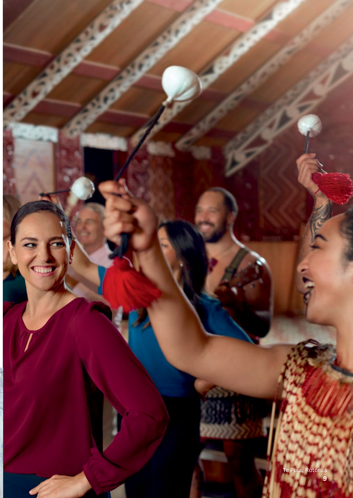
Te Puia, Rotorua