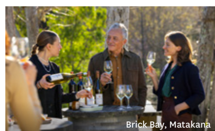
Brick Bay, Matakana