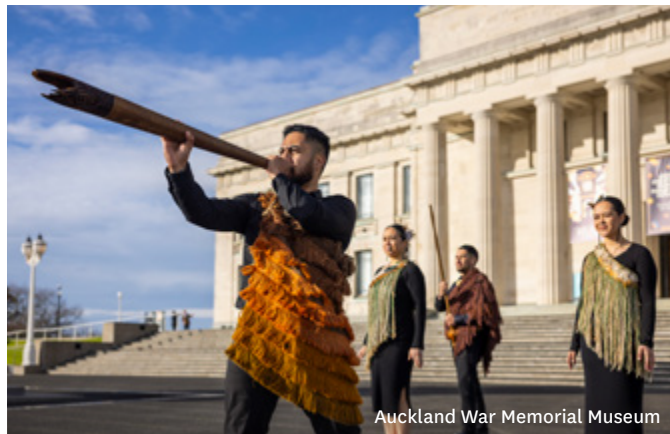
Auckland War Memorial Museum

Much of Auckland's inner-city accommodation is located within walking distance of the city's meeting venues, restaurants, bars, attractions, and shopping precincts. Alternatively, a modern transport network includes a city circuit bus service, plus taxi, ride share, train, and e-scooter options. Ferries provide access to a number of the islands of the Hauraki Gulf, including the 35-minute trip to Waiheke Island, renowned for its enticing vineyards and beautiful golden beaches.