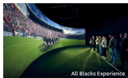
All Blacks Experience