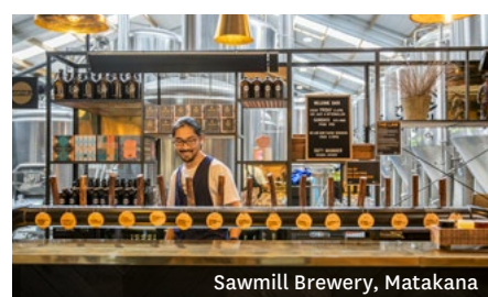
Sawmill Brewery, Matakana