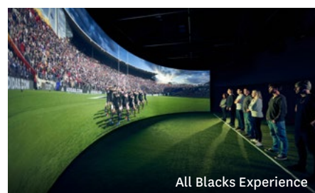
All Blacks Experience