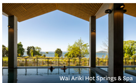
Wai Ariki Hot Springs & Spa