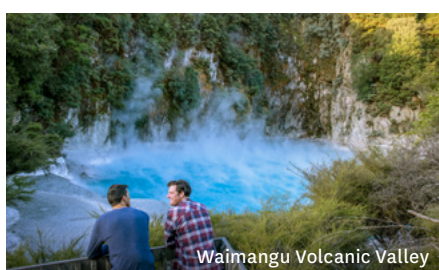
Waimangu Volcanic Valley