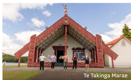
Te Takinga Marae