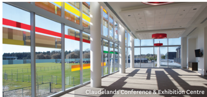
Claudelands Conference & Exhibition Centre

Finding your way around Hamilton is easy. Most hotels are a short walk or coach ride from major conference venues and the city centre. Transport options in Hamilton include bus services, taxis, Uber and shuttles. Luxury coach services can be arranged for conference, dinner, and airport transfers; or arrive in style by helicopter or limousine.