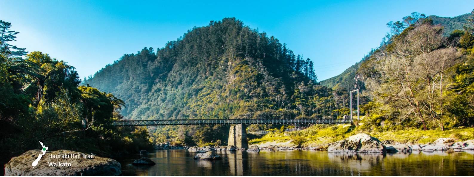
Hauraki Rail Trail Waikato