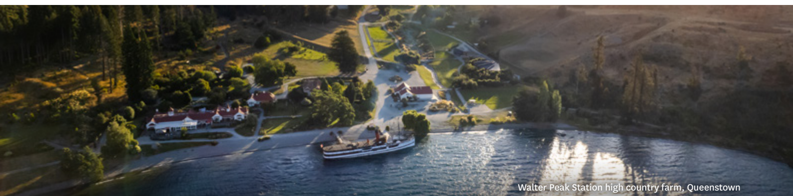
Walter Peak Station high country farm, Queenstown