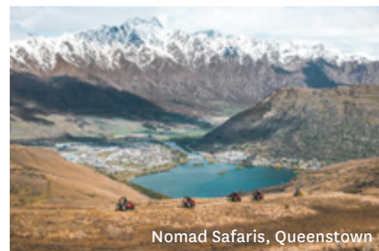
Nomad Safaris, Queenstown

Exclusive lakeside dining Return to Queenstown in the evening for dinner at an exclusive restaurant alongside Lake Whakatipu. World class restaurants on the waterfront serve some of the region's best fresh produce and wines. Relax with a meal as you look out over Queenstown's spectacular alpine landscape and the crystal clear water of Lake Whakatipu.