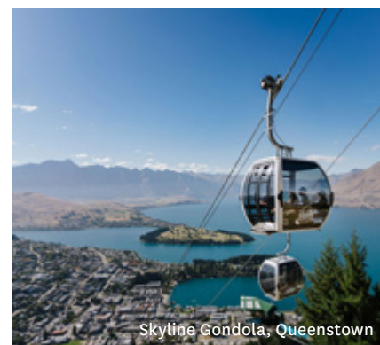
Skyline Gondola, Queenstown

Finish your trip in style No trip to Queenstown would be complete without dinner at Skyline's Stratosfare Restaurant & Bar. Situated on top of Bob's Peak and accessed by gondola, the restaurant serves a delicious buffet using fresh seasonal produce. It's one of the best spots in Queenstown to watch the sun go down.