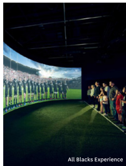
All Blacks Experience

Welcome dinner Kick off the evening at the All Blacks Experience, an interactive showcase of what it takes to make and shape New Zealand's legendary national rugby teams. Be inspired as a former player walks you through the concepts of culture, leadership and team development. Feel the excitement of game day and get competitive in the interactive zone. Enjoy a welcome dinner before being presented with a personalised All Blacks jersey as a gift.