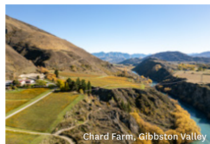
Chard Farm, Gibbston Valley